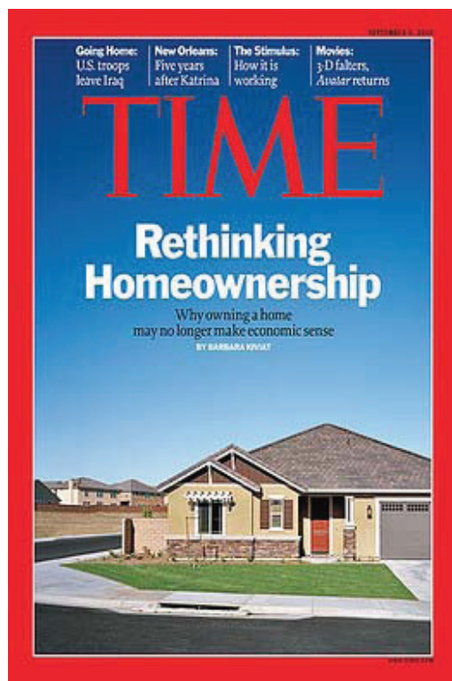
The Sept. 6 cover of Time magazine: This is what capitulation looks like.

Sure, maybe there's more pain to come in the housing market. But when Time magazine starts running covers that declare "Owning a home may no longer make economic sense," it's time to say: Enough is enough. This is what "capitulation" looks like. Everyone has given up.