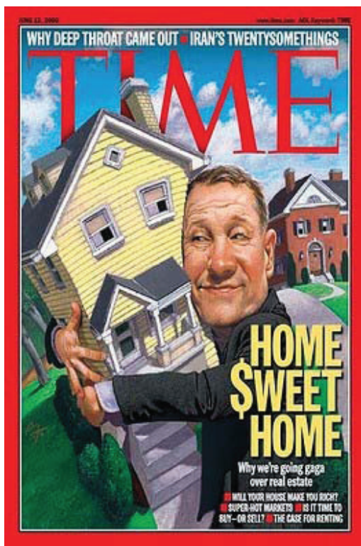
The June 13, 2005 cover of Time.

you'll need to do your math. You'll only get the income tax break if you itemize your deductions, and many people may be better off taking the standard deduction instead. The breaks are more valuable the more you earn, and the bigger your mortgage. But many people will find that these tax breaks mean owning costs them less, often a lot less, than renting.